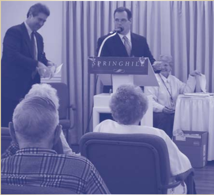
On December 1, 2005, the Asbury Foundation held an auction to benefit the creation of a Memory Support (Alzheimer's) Unit on the campus. Plans are underway for the 2nd Annual Auction.