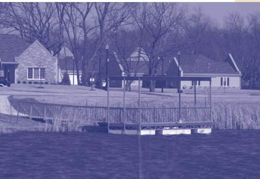
Fishing dock and walkway

We would like you to know what your gifts make possible! Look for this newsletter each spring and fall.